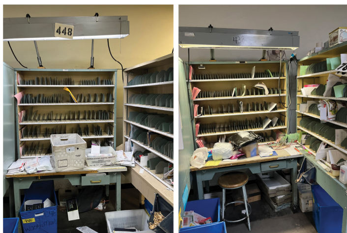
Figure 2. Examples of Delayed Mail in the Carrier Cases

On the morning of April 2, 2024, we identified 1,539 delayed mailpieces 13 at 29 carrier cases. Specifically, we identified 790 flats, 693 letters and 56 packages. See Figure 2 for examples of delayed mail found at carrier cases. In addition, management did not report this mail as undelivered in the Delivery Condition Visualization (DCV) 14 system. Further, the carriers were not using Postal Service (PS) Forms 1571, Undelivered Mail Report, 15 to document the undelivered mailpieces.