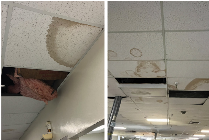
Figure 5. Stained and Missing Tile in Men's Restroom and Workroom Areas