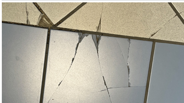
Figure 7. Broken Floor Tiles in Lobby Area