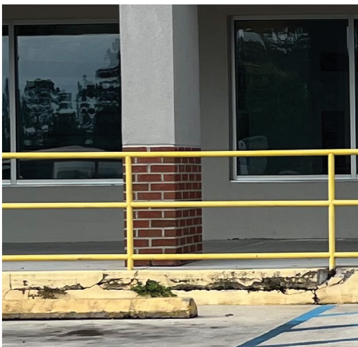
Figure 3. Deteriorating Handrail in Front of Building