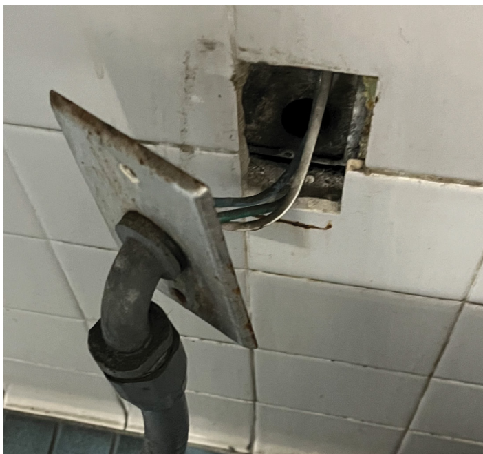
Figure 6. Loose Water Pipe Socket in Men's Restroom